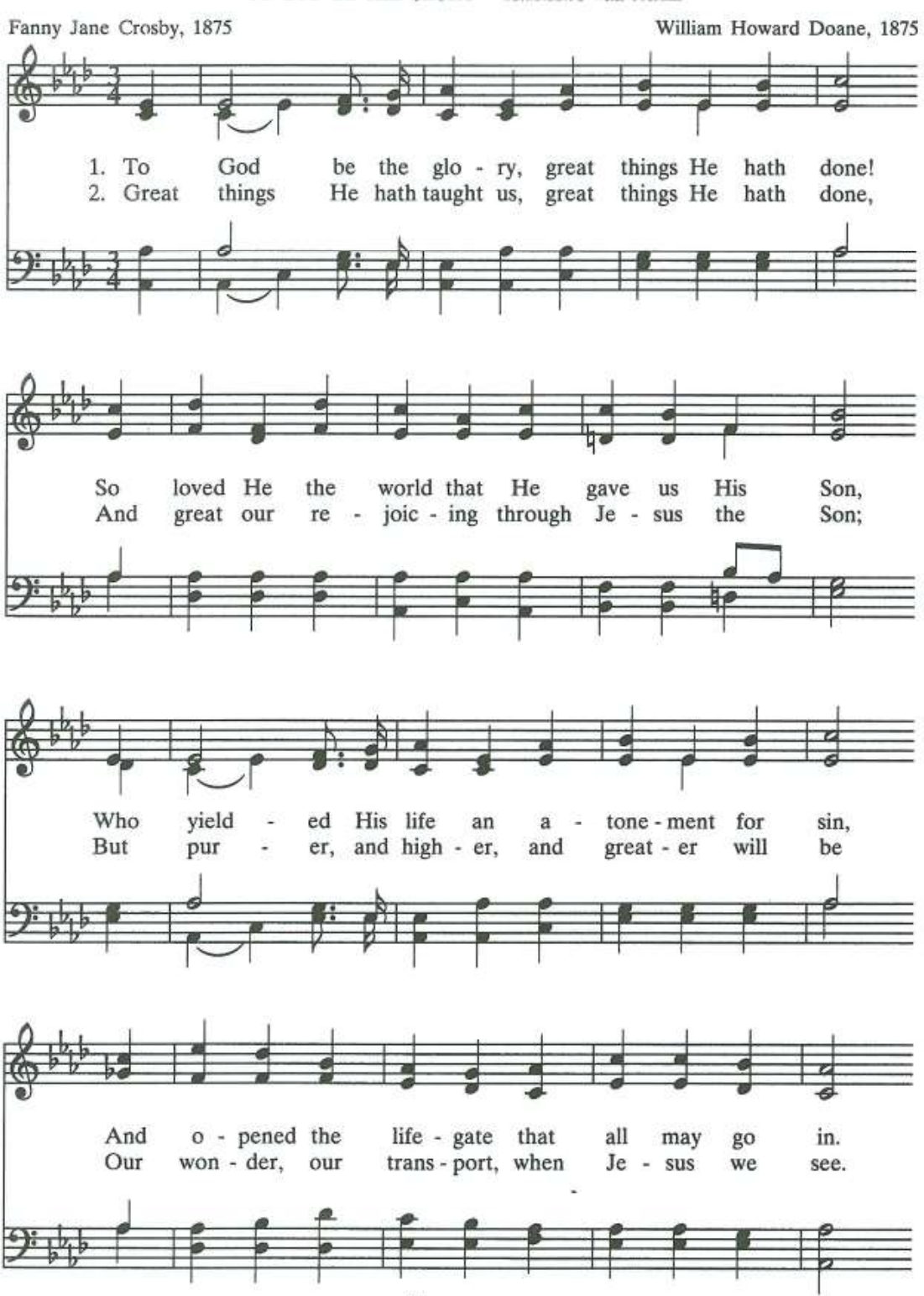
- continued, next page

TO GOD BE THE GLORY 11.11.11.11 with refrain